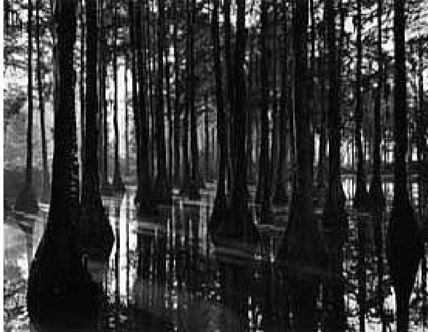
Brett Weston, "Untitled" (Cypress Swamp, North Carolina), c. 1947, Gelatin Silver Contact Print, 10 3/8 x 10 in., $6,500