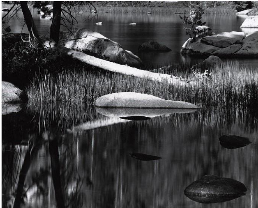
Brett Weston, "Untitled" (Sierra Lake), 1978, Silver Gelatin Print, 11 x 12 1/2 in., $4,000