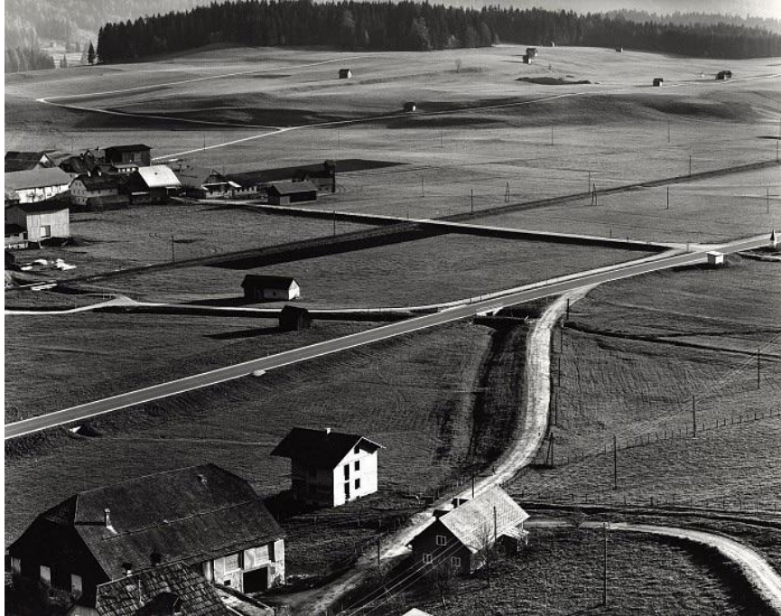
Brett Weston, "Untitled" (Farm, Austria), 1971, Silver Gelatin Print, 10 1/2 x 13 in., $5,000