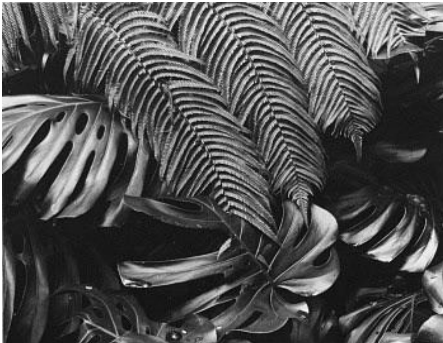
Brett Weston, "Untitled" (Fern Leaves, Hawaii), 1980, Silver Gelatin Print, 16 x 20 in., $11,000