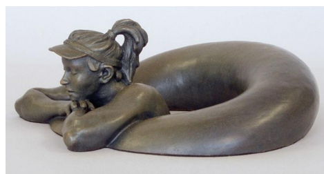
David Phelps, "Daydreamer," 2007, Bronze, 30 x 80 x 80 in., $36,000