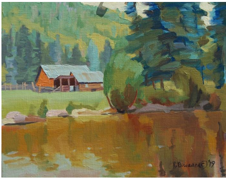
Karl Brenner, "Above Lemon Lake," 2019, Oil on Canvas, 14 x 18 in., $920