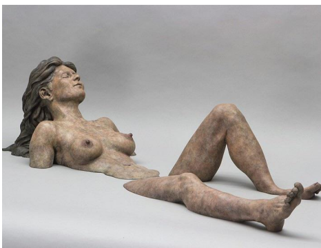
David Phelps, "American Beauty 3/35," Bronze, 9 x 40 x 12 in., $5,800