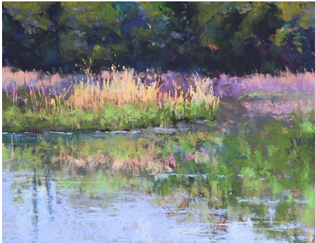
Janis Krendick, "White Rock Lake I," 2017, Pastel on Paper, 11 x 14 in., $800