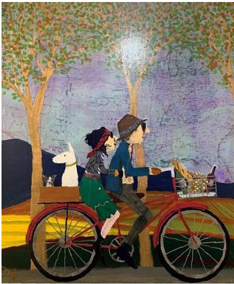
Denise Duong, "Limitless," 2019, Mixed Media on Canvas, 36 x 36 in., $3,000