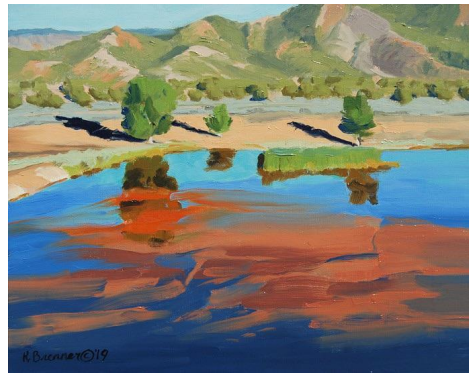
Karl Brenner, "Early Light, Zinks Pond," 2019, Oil on Canvas, 16 x 20 in., $960