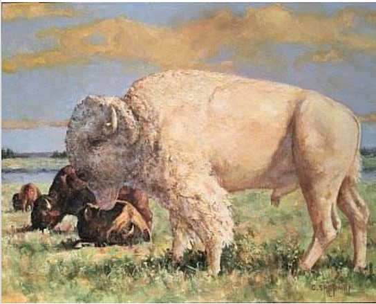
Gary Sherman, "White Bison," 2017, Acrylic on Board, 16 x 20 in., $600