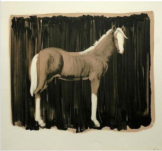
Joe Andoe, "Tan Horse on Black," 1989, Monotype, 35 x 28 1/4 in., $1,950