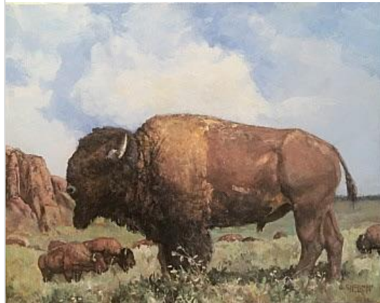
Gary Sheramn, "The Watcher," 2017, Acrylic on Canvas, 16 x 20 in., $300