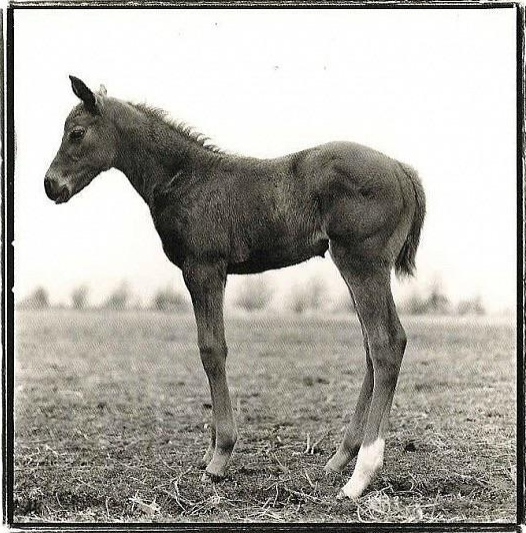
Keith Carter, "Focal Study 1," Photograph, 15 x 15 in., $1,200