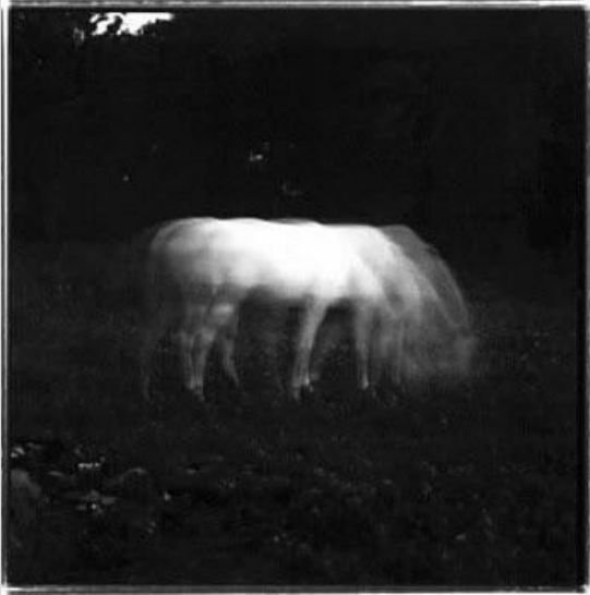
Keith Carter, "White Horse in Moonlight," Photograph, 15 x 15 in., $1,200