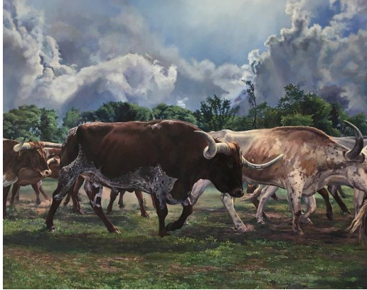
Jeff Dodd, "Longhorns 2," 2019, Oil on Panel, 40 x 32 in., $7,300