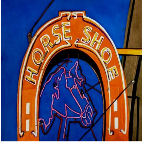
Caryl Morgan, "Horse Shoe Inn," 2015, Watercolor, 10 x 10 in., $475