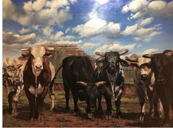
Jeff Dodd, "Rodeo Stock #44," Oil on Panel, 35 x 46 in., $7,200