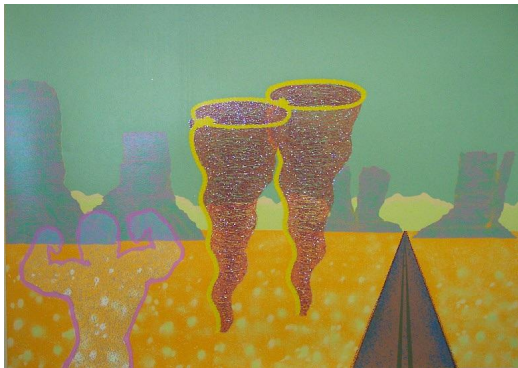
Dan Kiacz, "Tornado Twins Meet the Phantom Cactus," Serigraph, 19 x 27 in., $325