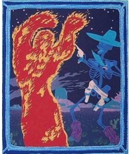
Dan Kiacz, "Rancho Enchantado I," Serigraph, 16 x 13 in., $325