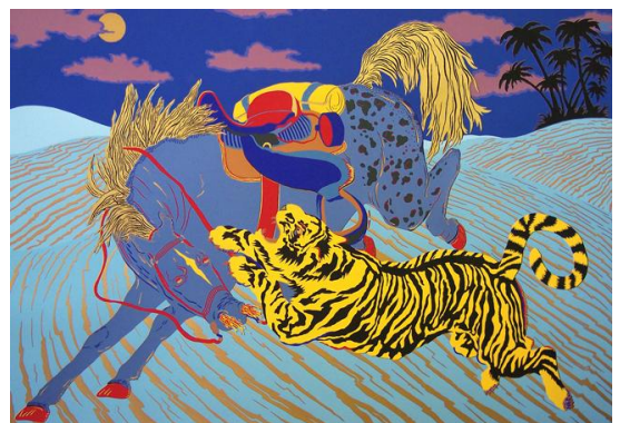
Dan Kiacz, "Tiger Twin," Serigraph, 36 x 48 in., $950