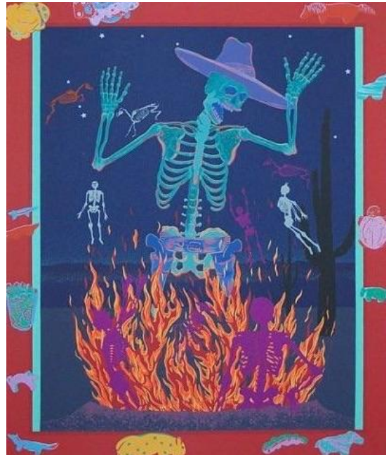
Dan Kiacz, "Rancho Encantado III," Serigraph, 16 x 13 in., $325