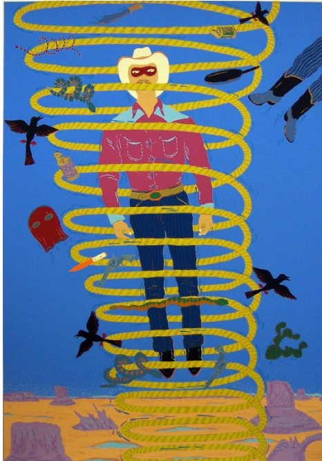
Dan Kiacz, "Cowboy in a Vortex," Serigraph, 27 x 19 in., $325