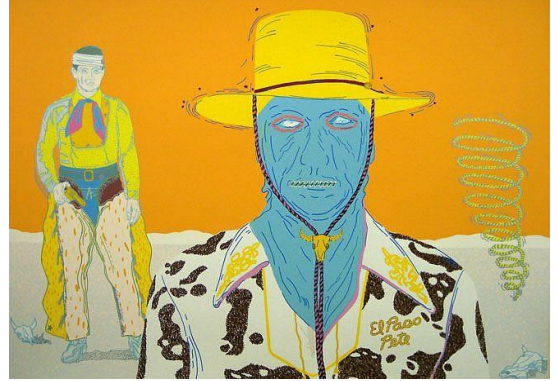
Dan Kiacz, "El Paso Pete," Serigraph, 20 x 28 in., $325